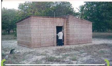
Top picture is Elias Makhule United Methodist Church Lower picture- the parsonage.